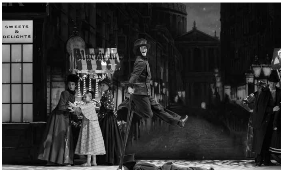
English National Ballet's 2024 production of Nutcracker.